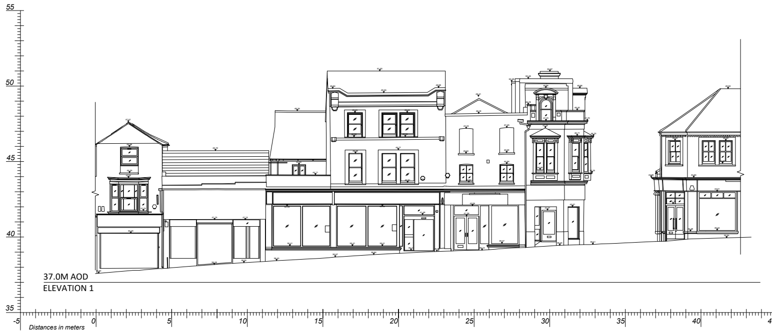
37.0M AOD ELEVATION 1