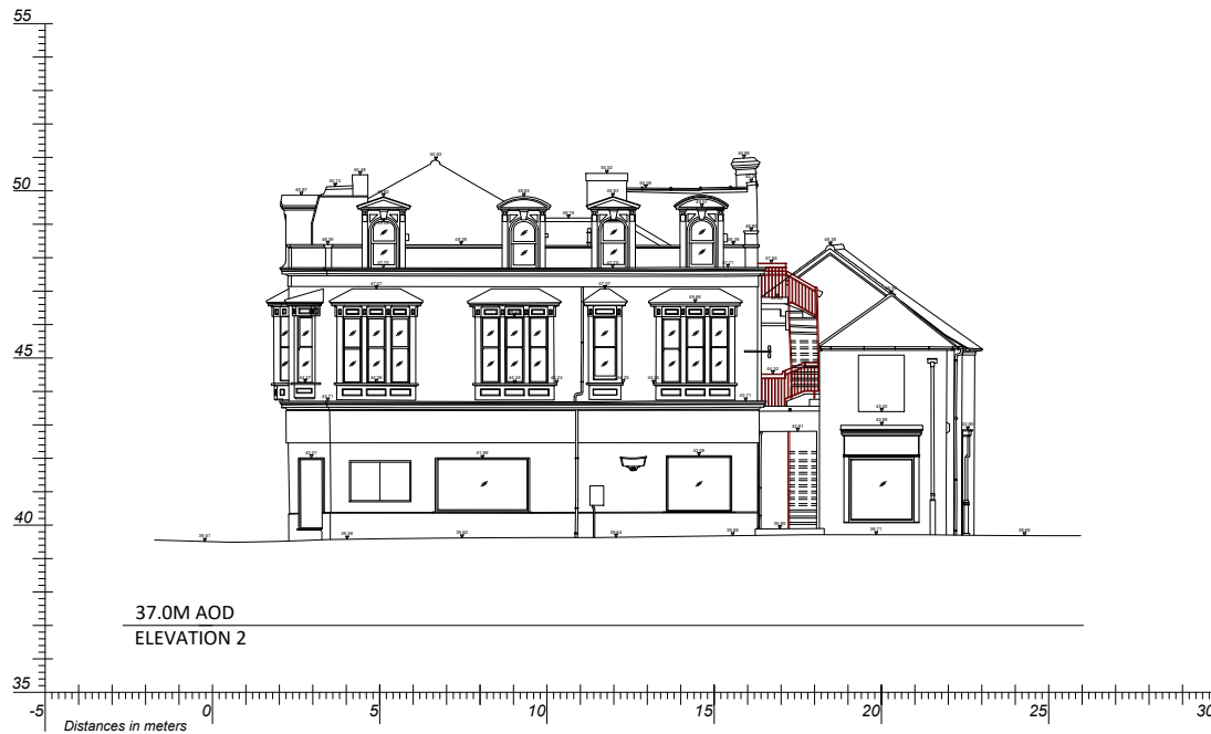
37.0M AOD ELEVATION 2